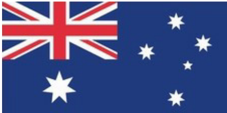
Figure 1 Australian Flag Quiz